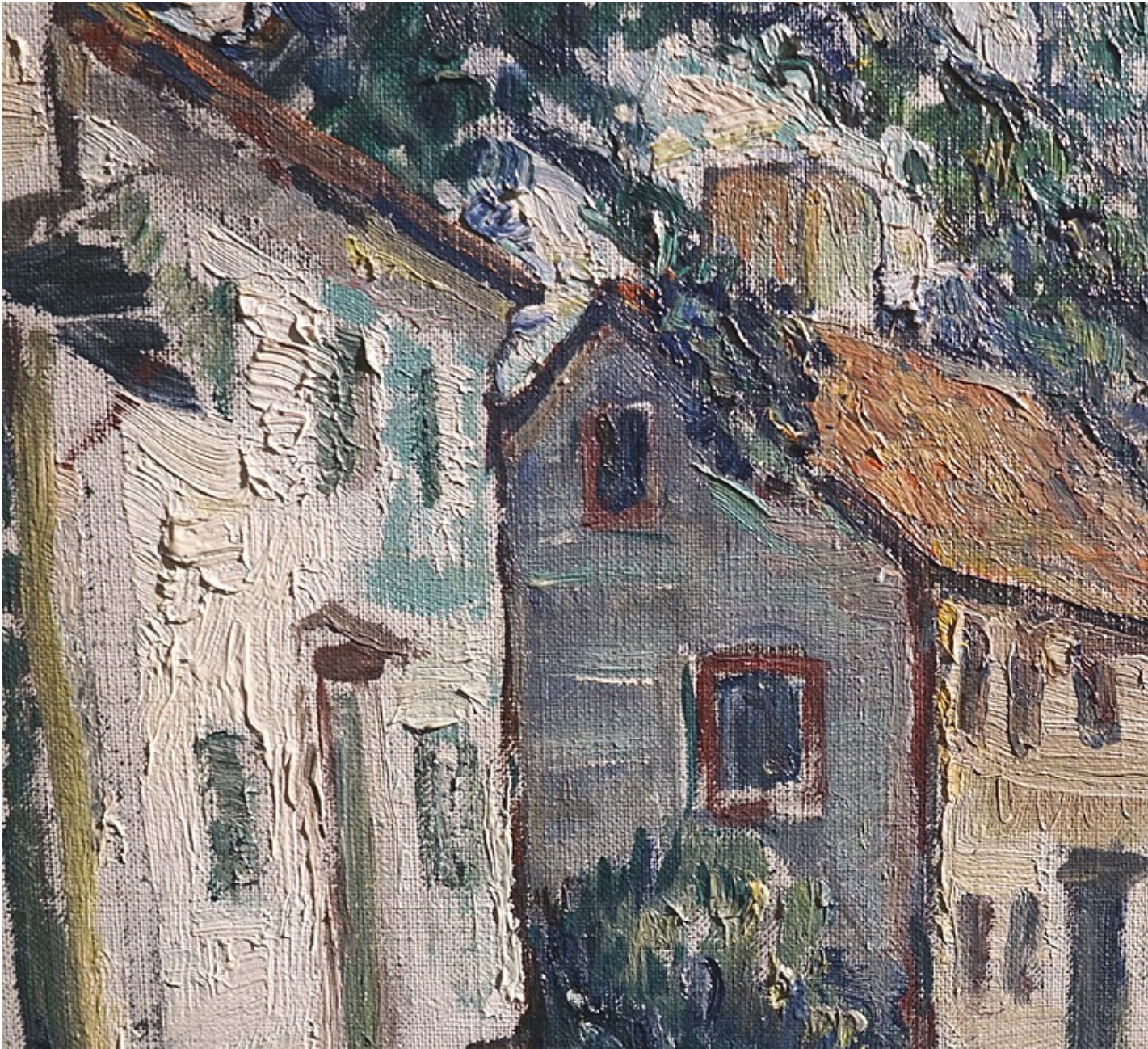
Russell Cheney, detail of brush work.