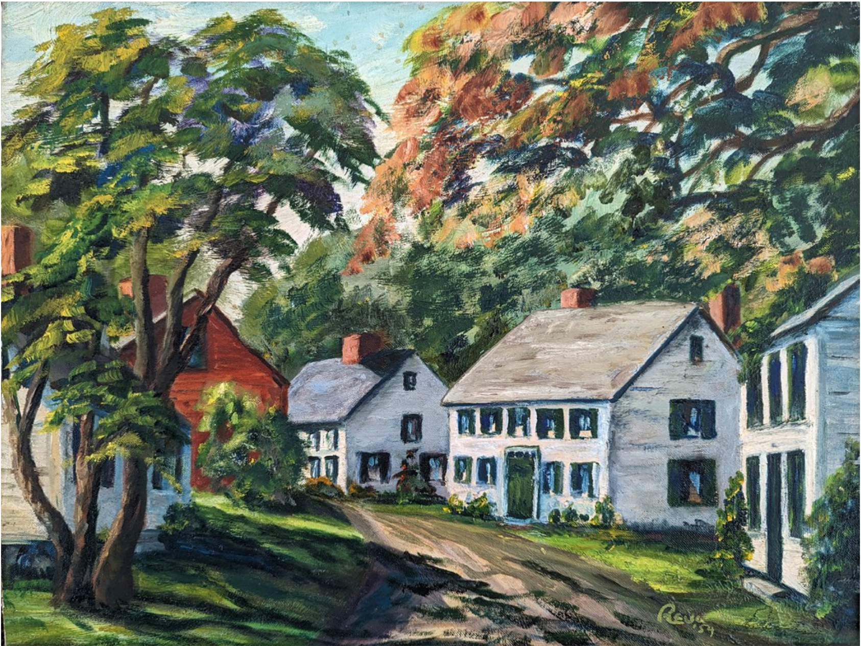
Reuc or Reug. 1954.