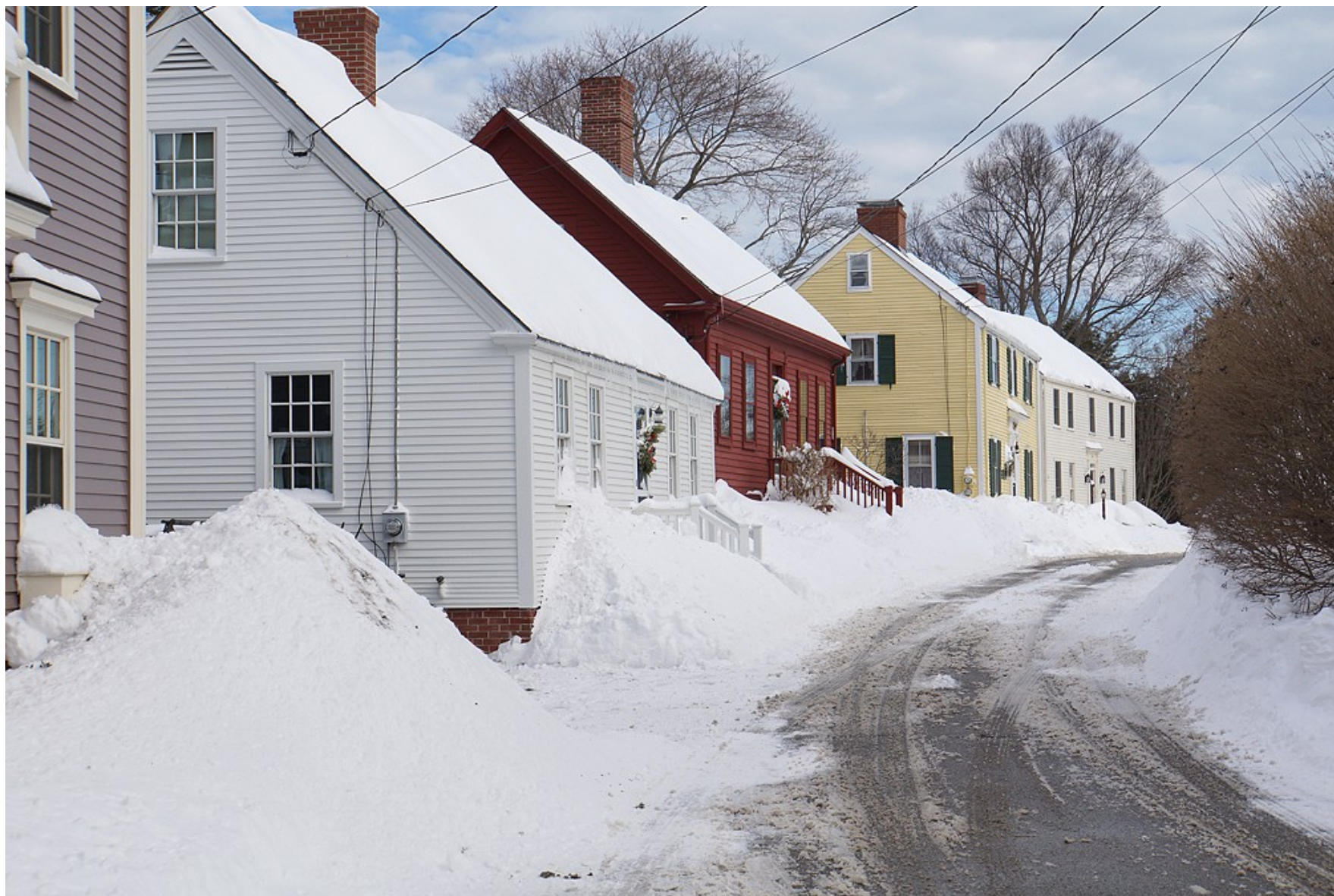
January 2015.