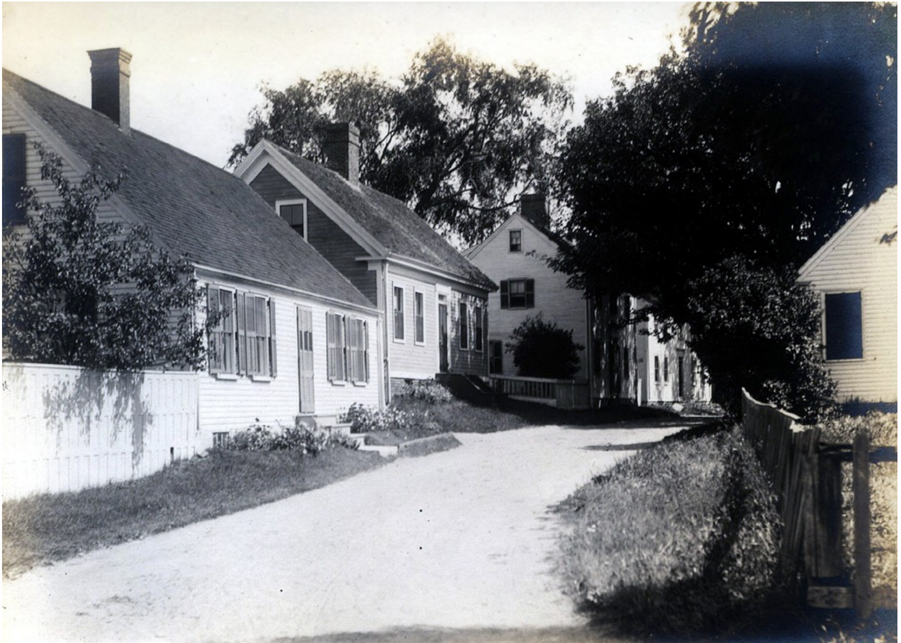
Florence Ewing or Charles Wood. ca. 1905.